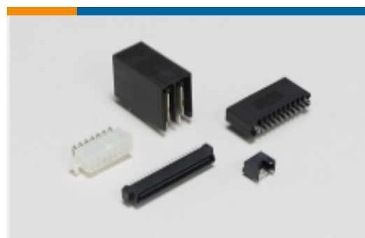
Standard Rectangular Connectors(2)