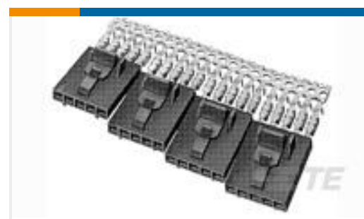
TE Part # 5-103960-9 2X10 MTE RCPT SR LATCH .100CL