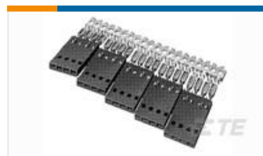
TE Part # 103648-9 10 MTE RCPT HSG SR RIB .100CL