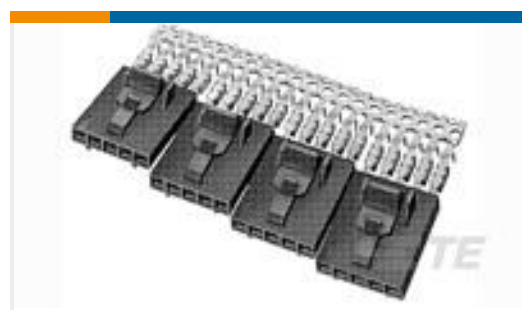
TE Part # 5-103957-9 2X10 MTE RCPT SR LATCH .100CL